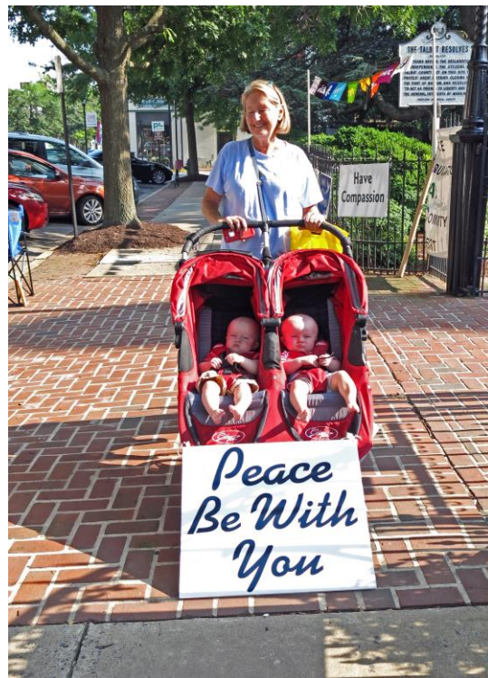
The littlest Peace Vigil participants