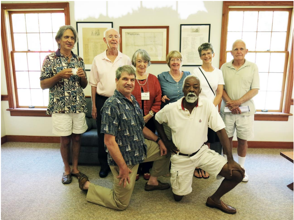
Abundant August Birthdays...don't ask how many!